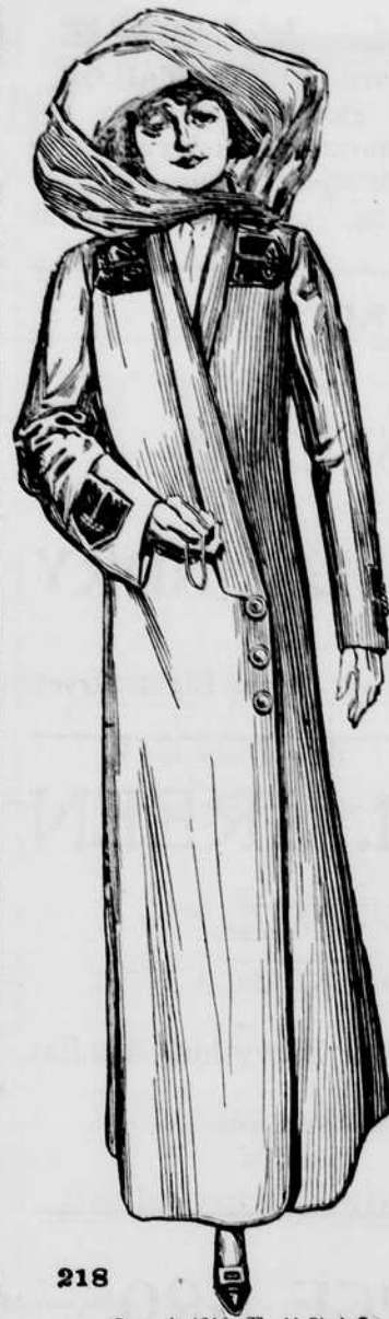
218 Copyright 1912 The H. Black Co Makers of Wooltex Garments

SAN FRANCISCO, May 31.—The "Flying Legion" of the San Francisco Commercial Club plans to visit British Columbia in August next to exploit the Panama-Pacific International Exposition. A special train is to be provided to carry one hundred prominent citizens, and it is expected that Mayor Rolph and President Charles C. Moeke, of the Exposition, will head the party. The visit is international in its scope and it is expected that Canadian government will be prevailed upon to make a big exhibition at the coming World's Fair.