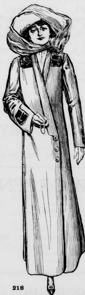
218 Copyright 1912 The H. Black Co. Makers of Wooltex Garments