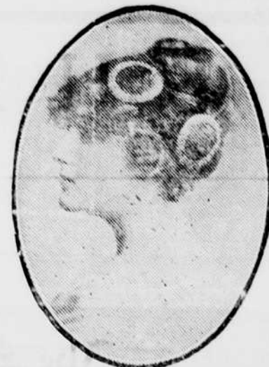
The Girl of the Pingree Shoe