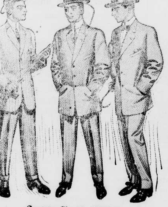
Suriety Brand Clothes Copyright 1911 Alfred Decker & Cohn

S. H. FRIENDLY & Co. inside your coat, meaus "the very best to be had for your money