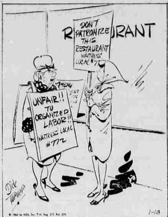
"You like the new hat? It's a fringe benefit in the new coat settlement I negotiated with Henry!"