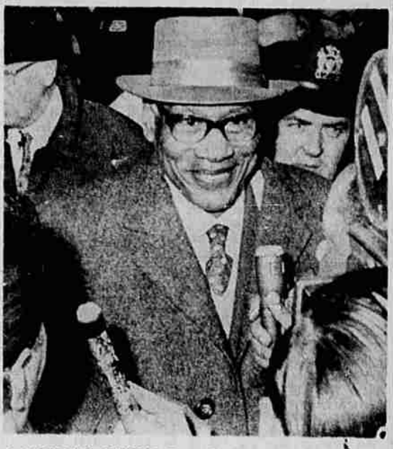
AMERICAN SINGER Paul Robeson, 65, smiles as newsmen fire questions at him upon his arrival at the John F. Kennedy International Airport in New York Sunday. Robeson, who has been associated with Communism in the past, is returning to the United States for the first time since 1958.

DALLAS (UPI)—Police today seized a snub-nosed 25-caliber automatic from the purse of a shapely red-haired stripper called to testify in behalf of her ex-boss, Jack Ruby, the self-appointed executioner of Lee Harvey Oswald.