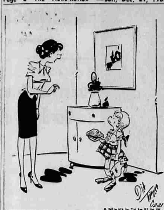
"Of course there's a Santa Claus, dear! And someday, somewhere, you'll meet the right one!"