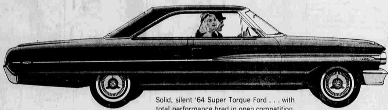
Solid, silent '64 Super Torque Ford... with total performance bred in open competition.

Ford made history at Riverside, Indianapolis, Atlanta, Monte Carlo. And now the '64 Fords are smashing sales records in Ford Dealer showrooms! Hot-selling Fords mean fast turnover, liberal trade-in allowance for your car. So see your Ford Dealer right away for a record-shattering buy on the Ford of your choice. Today!