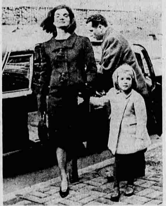
HEAD HELD HIGH, Mrs. Jacqueline Kennedy and Caroline arrive by White House limousine at the home of W. Averell Harriman, undersecretary of state, in Washington, Friday. The former First Lady and her children have moved from the executive mansion and will live temporarily in the house lent them by Harriman.