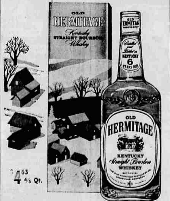
Attractively priced • 6 years old THE OLD HERMITAGE DISTILLERY COMPANY, LOUISVILLE, KENTUCKY, 86 PROOF

In the West... holiday time is Hermitage time!