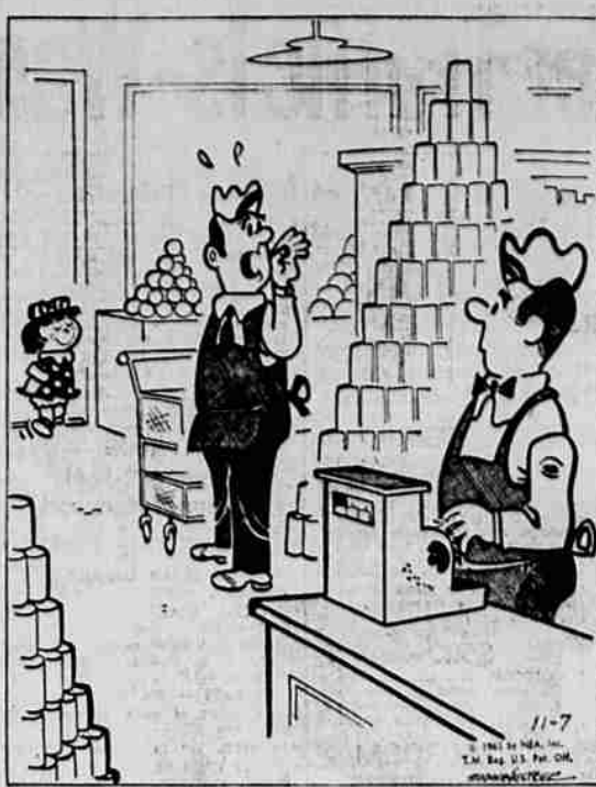
"Avalanche warning! Here comes the little girl who always takes things from the bottom!"

DOWN 1 Small rodents 2 East Indian woody vine 3 Italian painter 4 Make lace 5 Ear (comb. form) 6 Arboreal homes 7 Demons 8 Anger 9 Educational group (ab.) 10 Prognosis 11 Swiss measure