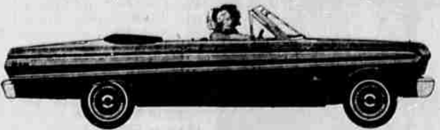
Falcon Convertible for 1964—one of 3 new Falcon top-downers.

Outside... inside... underside... wherever you look... Falcon is all new! Styling is totally new! Interiors! Ride!