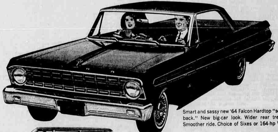
Smart and sassy new '64 Falcon Hardtop "scat-back." New big-car look. Wider rear tread. Smoother ride. Choice of Sixes or 164-hp V-8.

Go '64 Falcon... America's totally new compact car!