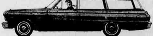
Falcon Squire for 1964—one of 7 roomy Falcon wagons.