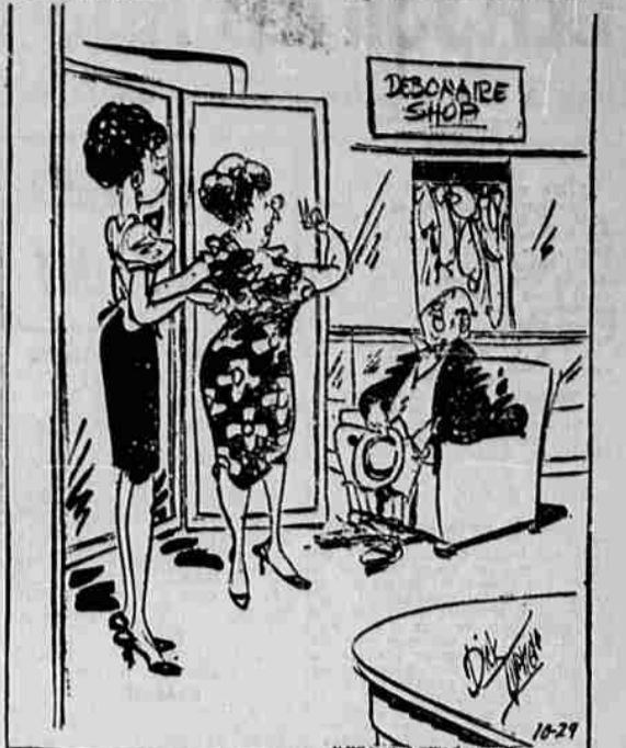
"I couldn't say whether or not that dress is 'really you,' Pet, but I can tell you that the price definitely isn't ME!"