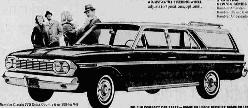
'64 Rambler Classic 770 Cross Country 6 or 198-hp V-8

NO. 1 IN COMPACT CAR SALES—RAMBLER LEADS BECAUSE RAMBLER LISTENS