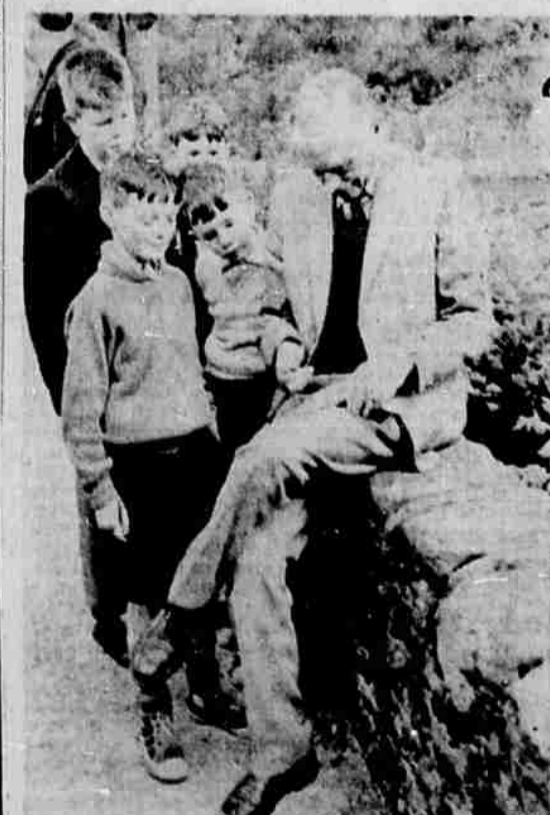
BRITISH PRIME MINISTER Sir Alec Douglas-Home interrupts his morning stroll to sign autographs for a group of young fans, after attending church services at Comrie, Scotland, Sunday. The new Premier, who renounced his title, is currently campaigning for a seat in the House of Commons prior to by-elections at Kinross.