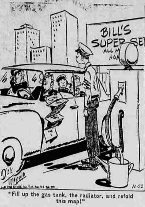
"Fill up the gas tank, the radiator, and refold this map!"