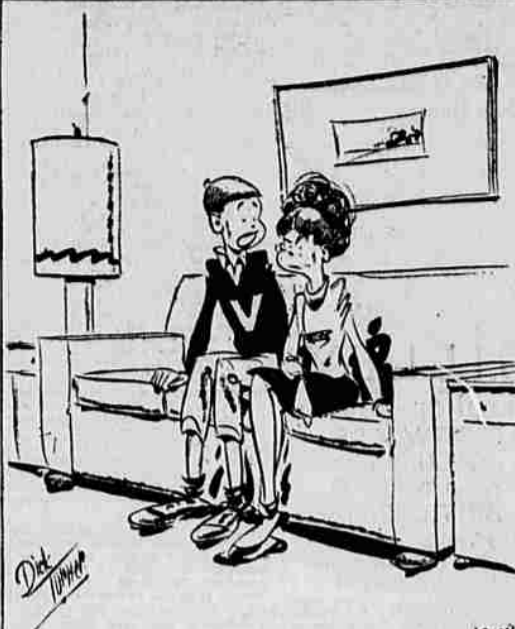
"I wouldn't trade you for a movie star, Janie... even if her steady was stupid enough to make the change!"