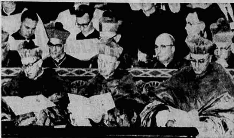
CHURCH PAYS HONOR —American Princes of the Roman Catholic Church, left to right, Jose Cardinal Quintero of Caracas, James Cardinal McIntyre of Los Angeles, and Albert Cardinal Meyer of Chicago, occupy front row seats during beatification rites of 19th Century Bishop John N. Neumann of Philadelphia, in St. Peter's Basilica in Vatican City Sunday. A Bohemian-born immigrant, he is the first American male to receive the church's highest honor.

The First Lady discovered today that the birth of a Moroccan baby and the intrigues of North African strife were getting more attention than her visit here. The city she chose for her "rest" vacation recombined with both merrymaking and the camp of troops.