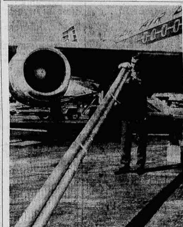
WORLD'S CHAMPION pole vaulter, John Pannel, prepares to load his famous fiberglass vaulting poles into the hold of a Japan air liner prior to taking off for Tokyo Wednesday to participate in the Tokyo International Sports Week. Pannel holds the world's record in the pole vault with a leap of 17-0 3/4.