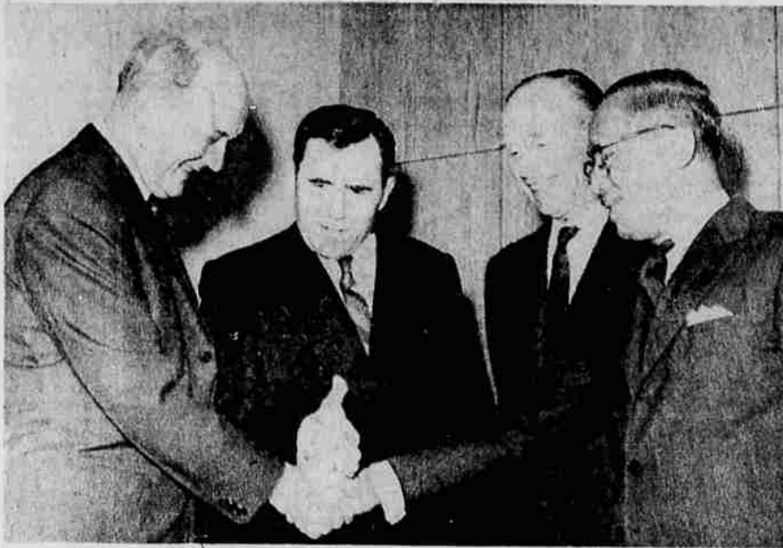
SOVIET FOREIGN MINISTER ANDREI GROMYKO, second from left, laughingly "splits" a handshake between U. S. Secretary of State Dean Rusk and UN Secretary General U Thant, while British Foreign Secretary Lord Home looks on. The "Big Three," Rusk, Gromyko and Home, were attending a dinner party given for them Monday by U Thant.

Although the document clearly reiterates the traditional Catholic teaching that Christ conferred special powers upon the apostles (and their successors, the bishops of today), it emphasizes that "those who stand out in power as ministers serve their brothers."