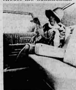
Notice the greater passenger room.

When you inspect the new Continental you will discover why more than half the people who buy in our price range choose the Continental.