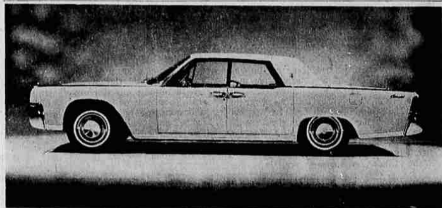
THE LINCOLN CONTINENTAL incorporates significant increases in interior spaciousness and luggage capacity for 1964. While continuing its classic styling theme, the 1964 Continental is increased three-inches in over-all length and wheelbase. The Continental roof is 5.4 inches wider in 1964, providing the car with a new styling flair in addition to increased head room in both front and rear seats. The car has a longer profile and is enriched with a new grille, extensive new body sheet metal and exterior ornamentation. The luggage capacity has been increased by 15 per cent. New models are now on display at Mock Motors in Roseburg.

The Berbers were among the fiercest fighters against the French in Algeria's seven-year war of independence. They fought bitterly in their mountain strongholds and the French never really subdued them.