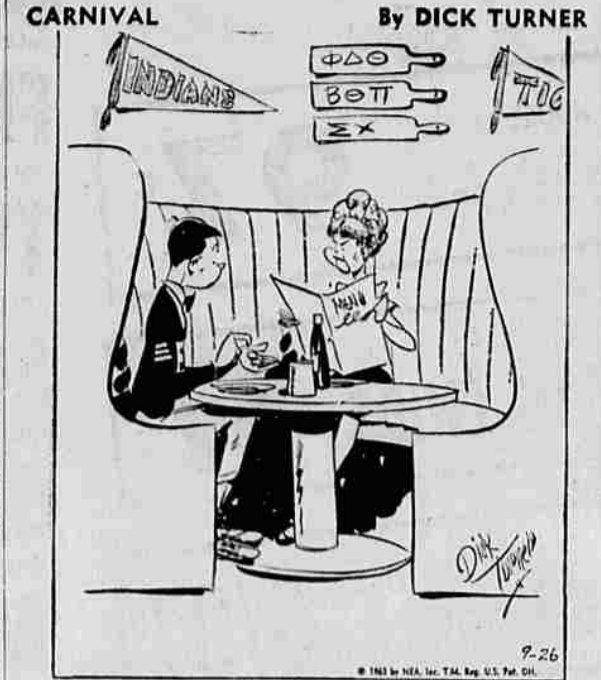
"I know you told me you were saving your money for something important, but I naturally thought you meant dessert with our hamburgers!"