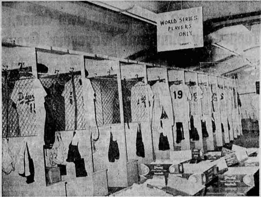
SIGN OF THE TIMES greeted Los Angeles Dodgers as they showed up Tuesday for their game with the New York Mets. Not a player was on hand at Dodger Stadium to cheer as the Chicago Cubs defeated the Cardinals in a day game to give the Dodgers the National League pennant. The sign over the souvenir balls points to the next test for the Dodgers — World Series against the New York Yankees.