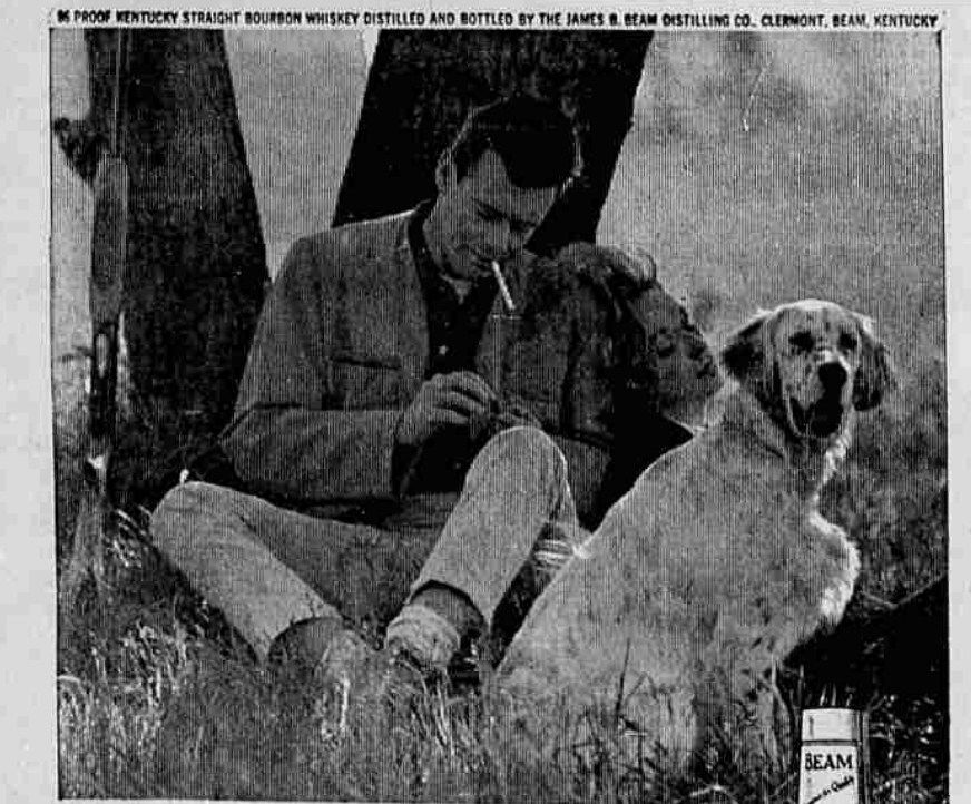
60 PROOF KENTUCKY STRAIGHT BOURBON WHISKEY DISTILLED AND BOTTLED BY THE JAMES B. BEAM DISTILLING CO., CLEMONT, BEAM, KENTUCKY

In Oregon, people have a taste for good living... If you have a taste for good living, you'll enjoy the taste of Jim Beam. It's leisurely distilled to the same formula originally created by Jacob Beam back in 1795. The smooth, light Kentucky straight bourbon that fills your leisure moments with pleasure. Taste it. Enjoy it. Only Beam tastes like Beam. Only Beam tastes so good.