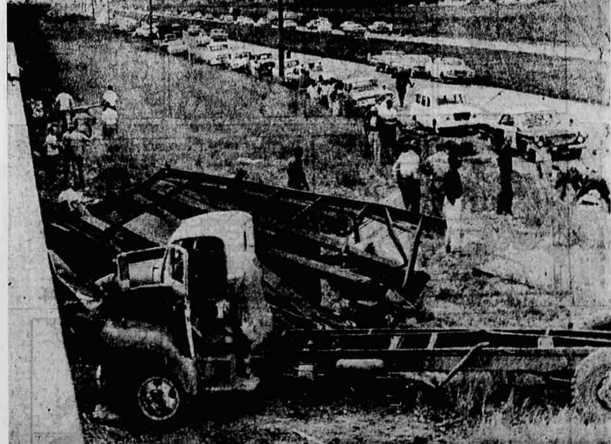
AS TRUCK-BUS LIES mangled in foreground after being struck by a Southern Pacific train near Chular, Calif. Tuesday rescue workers help injured and carry away dead. Some