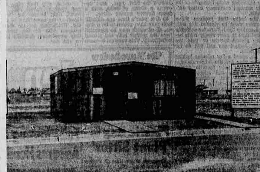
THIS SOVIET UNION 'DREAM HOUSE' will be displayed at the Oklahoma State Fair beginning Sept. 21. It was built by Oklahoma Gas and Electric Co. from plans that won a prize for the architect. It is worth 22,000 rubles, the equivalent of three years average income in Russia. An American could buy a $20,000 house with three years of average income.