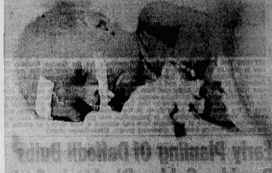
THE ONE BOY in the Fischer quintuplets seems to fret in his isolette in St. Luke's hospital late Tuesday. The quintuplets' hands have been covered to prevent them from tampering with the plastic tubes used to feed them.