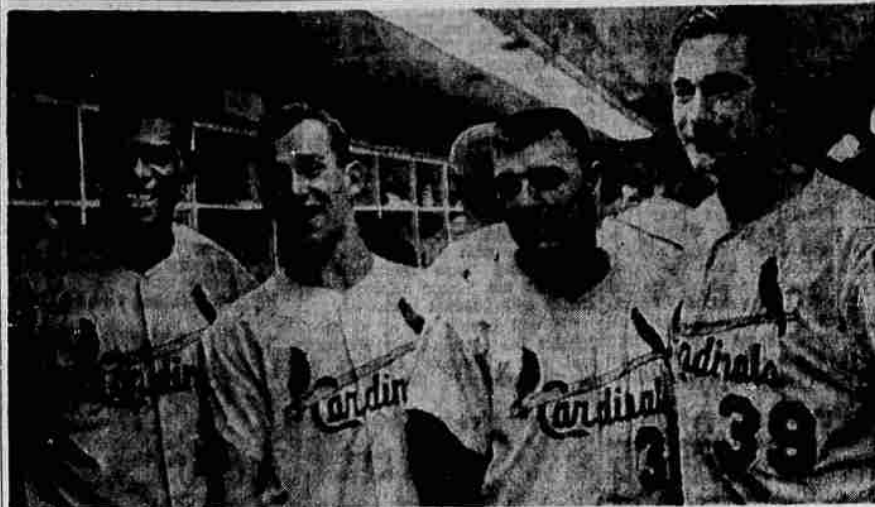
FOUR CARDINAL PITCHERS who combined to shut out Chicago Cubs three out of four, with Ernie Broglio pitching an 8-3 victory in the other game, Thursday, are all smiles as the Cards won their 15th out of the last 16 games. Left to right are Bob Gibson, Roy Sadecki, Curt Simmons and Ron Taylor. Gibson and Simmons each went 9 innings. Sadecki, who started Wednesday, needed help from Taylor, who went in in the sixth inning and preserved Sadecki's shutout.