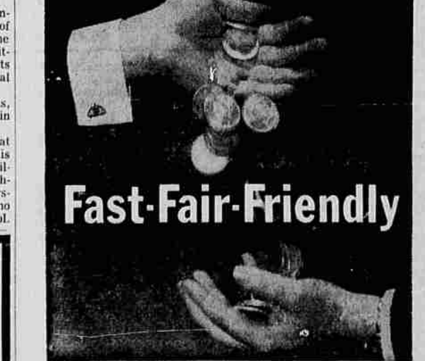
FAST SERVICE. Around the clock, across the country, the man from Farmers is at your side. Protects your interests. FAIR SETTLEMENT of claims. No red tape. Your Agent can inspect damages, arrange for repairs, sign the check. FRIENDLY PEOPLE ready and willing to serve you. NEVER too busy to stop and help. Just call.