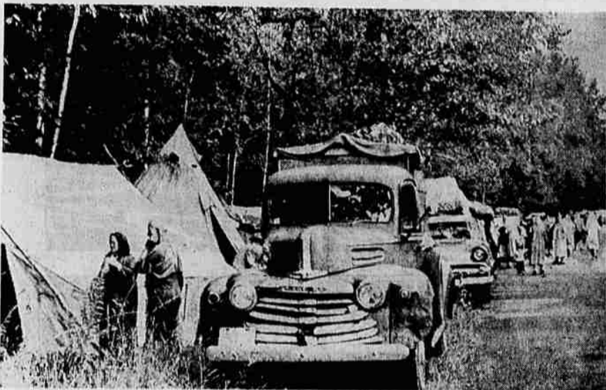
DOUKHOBORS MARCH — Some 500 radical "Sons Of Freedom" set up a makeshift camp near federal prison in Agassis, B.C. to "be near" friends and relatives imprisoned for terrorist arson and bombing attacks.

Sat., Aug. 24, 1963 — The News-Review, Roseburg, Ore. 7