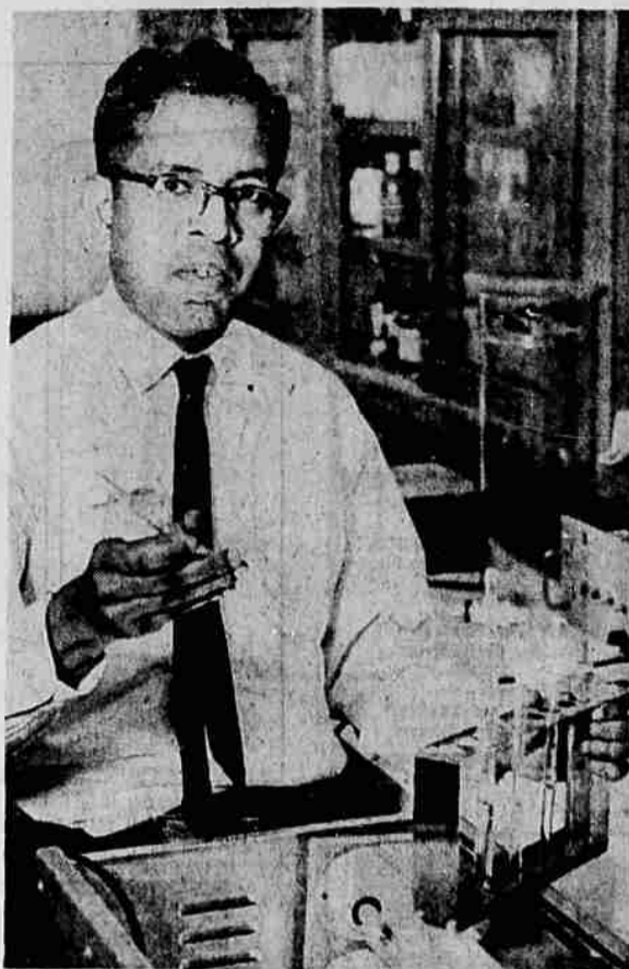
CEYLONESE SCIENTIST working at Ames Research Center at Moffet Field, Calif., has synthesized a life-essential molecule in a way that might have happened naturally in earth's primitive oceans four billion years ago. Experiment demonstrates life could have arisen naturally, without the intervention of supernatural powers.