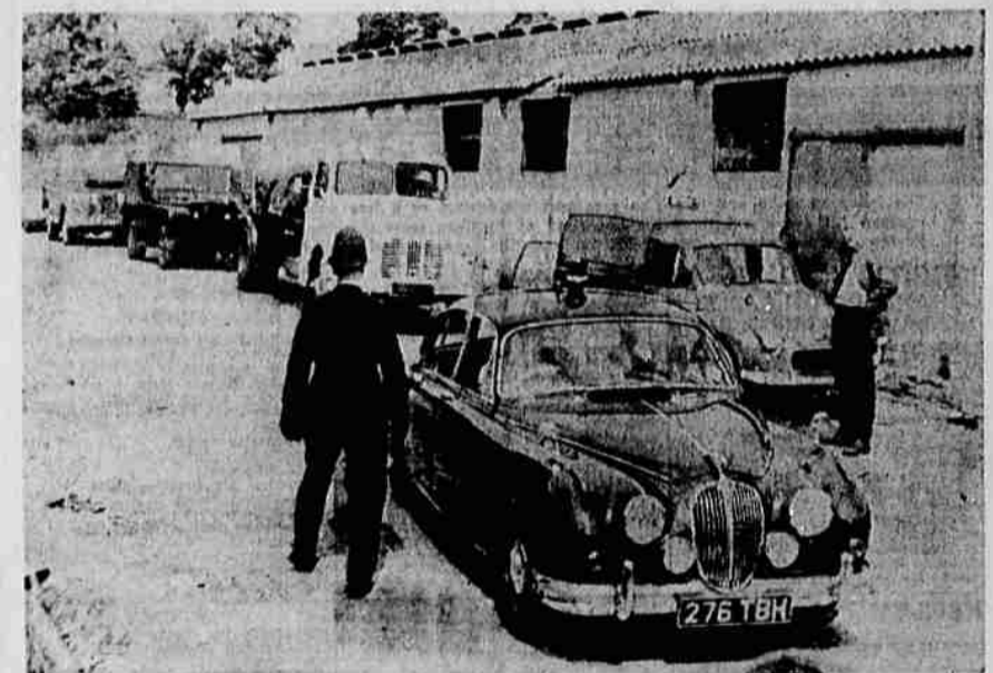
POLICE JAGUAR leads the way as a special convoy leaves Leatherslade Farm near Oakley, England early this week. The vehicles are the trucks, Land Rovers, and automobiles used by the "Great Mail Train Robbery" bandits to carry their loot away from the robbery scene to their hideout.