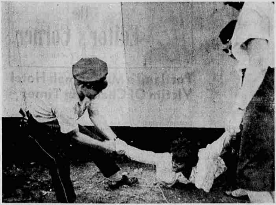
A DEMONSTRATOR who had lain under mobile classroom in Chicago in a desperation measure is dragged out Monday by police officers. Demonstration took place as the first of a projected 18 mobile classrooms were brought to the site for use in time for opening of the fall semester.