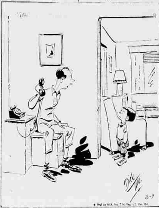
"It's your mother! Get Daddy's slippers and a magazine!"