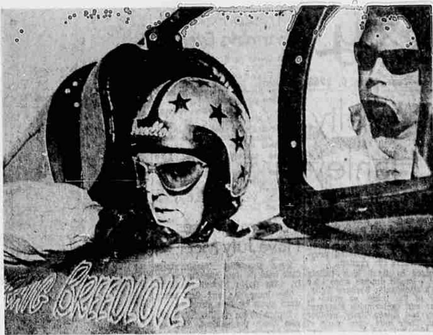
NEW RECORD — Craig Breedlove sits in his "Spirit of America" prior to setting a new land speed record at the Bonneville Salt Flats. Breedlove's jet powered racer skimmed over the desert at a 408 miles per hour average for the two runs to shatter the old mark.

NEW YORK (UPI) — The Harlem Globe Trotters have announced a four-game schedule that will wind up the team's out-of-town activities for the season. The Trotters play at Roosevelt Stadium, Jersey City, N. J., Aug. 20; the Polo Grounds, New York, Aug. 22; Fenway Park, Boston, Aug. 23; and Dillon Stadium, Hartford, Conn., Aug. 25.