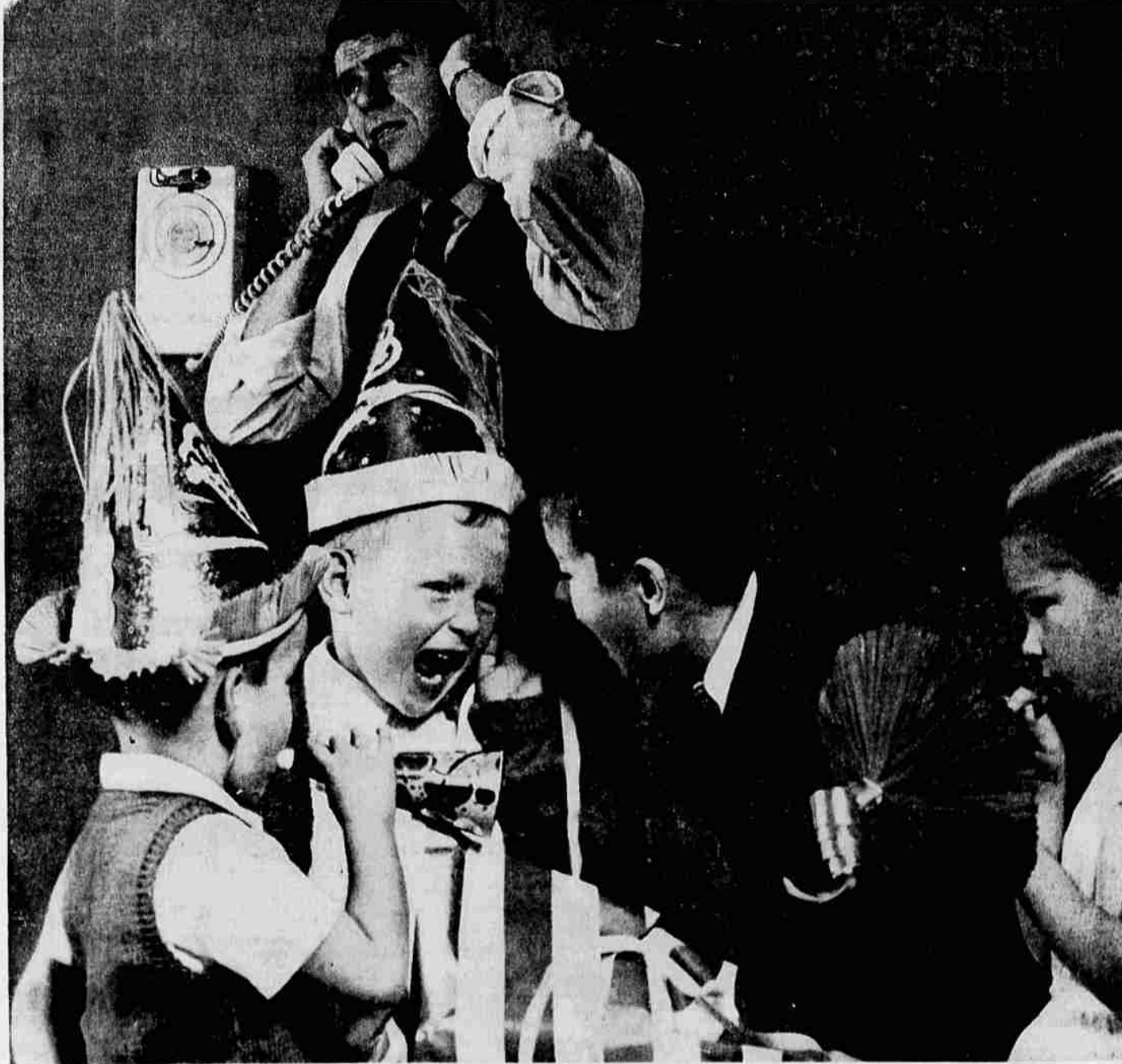
This is one way to hear your party.