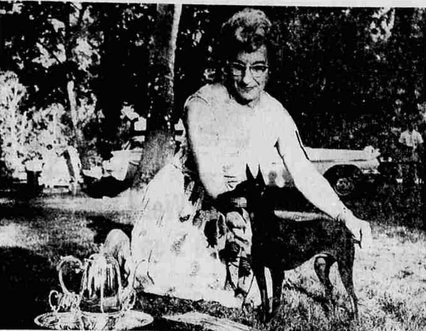
THE CHAMP — Canadian and American Champion Reedkroft Zarett, a toy Manchester terrier, scored a startling victory by being named best dog in show at the Umpqua Kennel Club's All-Breed Show and Obedience Trial Saturday at Umpqua Park. It is very unusual for a dog of this breed to win such an honor. (See story page 2.)