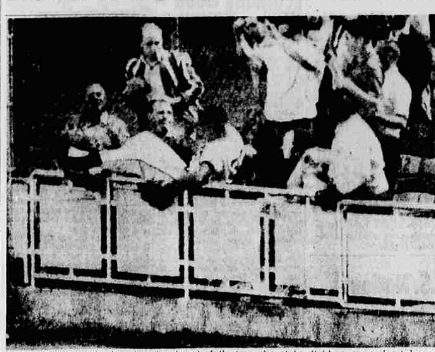
LEE THOMAS of the Los Angeles Angels falls into the right field seats as he takes a homerun away from Tony Kubek of the New York Yankees. Thomas' catch was made during the second inning of the Angels-Yankee game in Los Angeles' Chavez Ravine Friday.