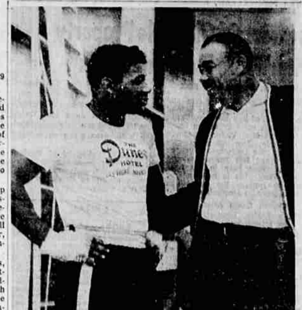
FORMER HEAVYWEIGHT CHAMPIONS Floyd Patterson, left, and Joe Louis compare notes at the Dunes Hotel in Las Vegas, where Patterson is training for his attempt to regain the title from Sonny Liston. The title bout will be held at the Las Vegas Convention Center on July 22.