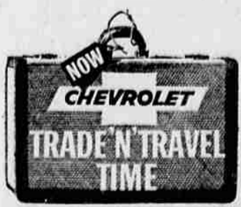
AT YOUR CHEVROLET DEALER'S

But since we began by talking about driving, let's stick with that awhile. A large factor in the fun of driving a Corvair is the location of its engine in the