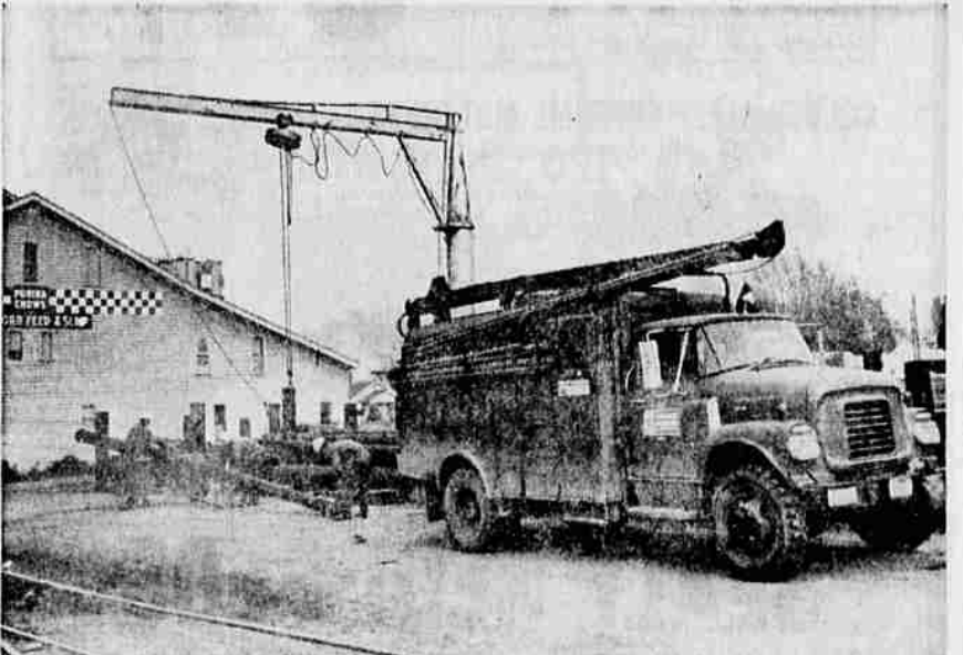
ACTIVITY HEAVY — At 8 o'clock each morning, PP&L's service center on Diamond Lake Boulevard teams with activity as crews load their trucks with all the materials, tools and equipment they expect will carry them through their day's work. On the other side of the warehouse, a power pole rig is hitched to a company service truck which will soon roll out to one of the company's jobs.