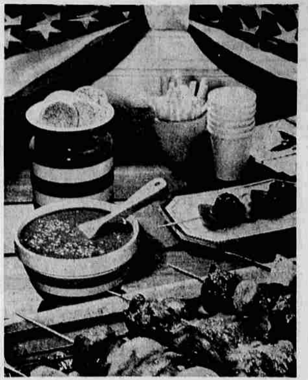
... 1776 barbecue sauce

New notion in a la mode desserts: Combine 2 1/2 cups canned apple slices with 1 cup sugar and 1/2 teaspoon cinnamon. Simmer about 10 minutes until slices are slightly soft. Cool and add 3/4 ounce can flaked coconut; 1/2 cup currants and top with vanilla ice cream. Makes 4 to 6 servings.