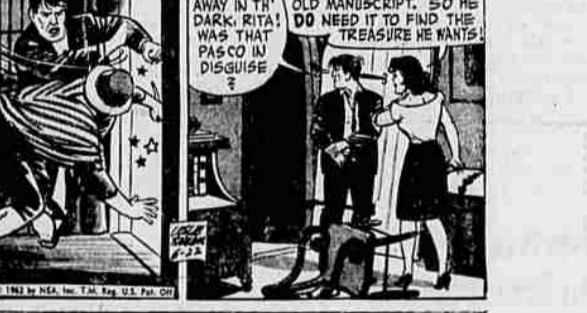
HE GOT AWAY IN THE DARK, RITA! WAS THAT PASCO IN DISGUISE?