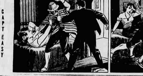
HE GOT AWAY IN THE DARK, RITA! WAS THAT PASCO IN DISGUISE?