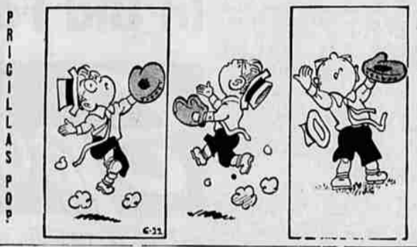
THEY DON'T MAKE MITTS LIKE THEY USED TO!