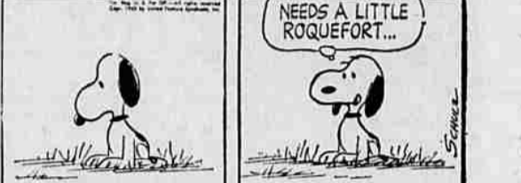
NEEDS A LITTLE ROQUEFORT...