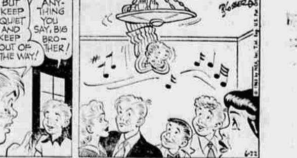
I TOLD YOU WE DIDN'T HALF APPRECIATE THAT FELLOW'S ABILITY!