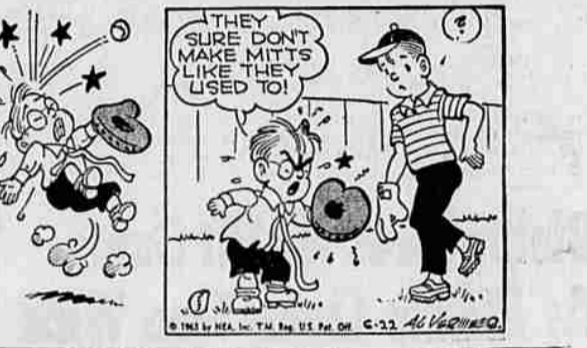
THEY DON'T MAKE MITTS LIKE THEY USED TO!