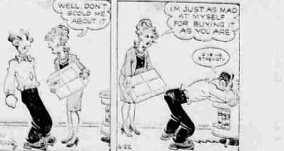
CAN'T WE LET HIM STAY THERE AND ENJOY HIS NEW FOUND POWER FOR A WHILE?