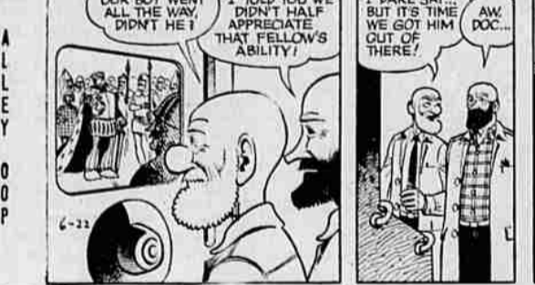
OUR BOY WENT ALL THE WAY, DIDN'T HE?