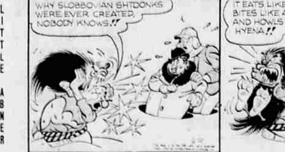
T DARE SAY, BUT IT'S TIME WE GOT HIM OUT OF THERE!