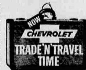
AT YOUR CHEVROLET DEALER'S

Chevy II Wagons —The heft of a suitcase. The rattle of a road map. There's something about one of these spruce, surprisingly spacious wagons that can turn even the routine preparations into a happy part of your trip. Take that old bugaboo of packing, for instance. No bother. With the kind of room you get in that easy-loading cargo compartment, you can just about toss things in any old whichway and come out with space to spare. The load won't dampen the spirits of the spunky 6-cylinder engine either. It just hums along passing up gas pumps (there's also a choice of an even thriffter 4 in most