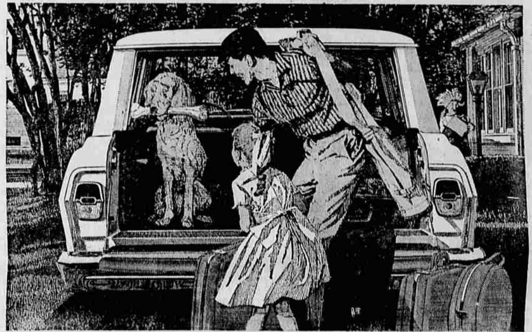
Load up, Chevy II Nova 400 6-Passenger Station Wagon