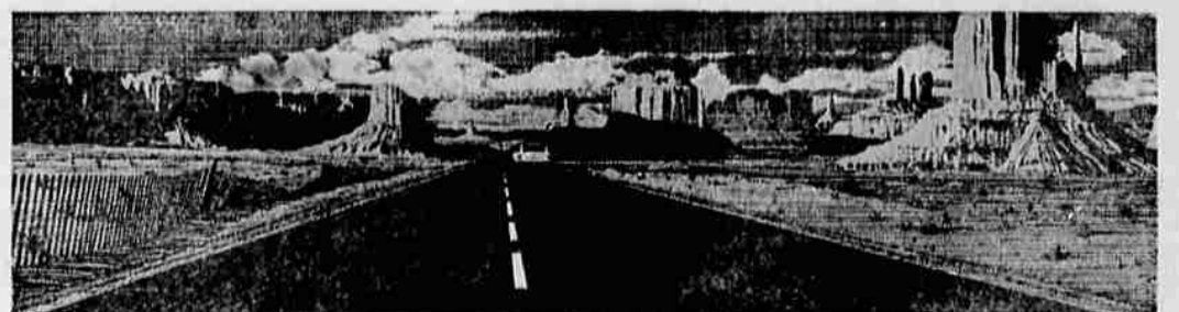
and get lost...

Chevy II Wagons —The heft of a suitcase. The rattle of a road map. There's something about one of these spruce, surprisingly spacious wagons that can turn even the routine preparations into a happy part of your trip. Take that old bugaboo of packing, for instance. No bother. With the kind of room you get in that easy-loading cargo compartment, you can just about toss things in any old whichway and come out with space to spare. The load won't dampen the spirits of the spunky 6-cylinder engine either. It just hums along passing up gas pumps (there's also a choice of an even thriffter 4 in most