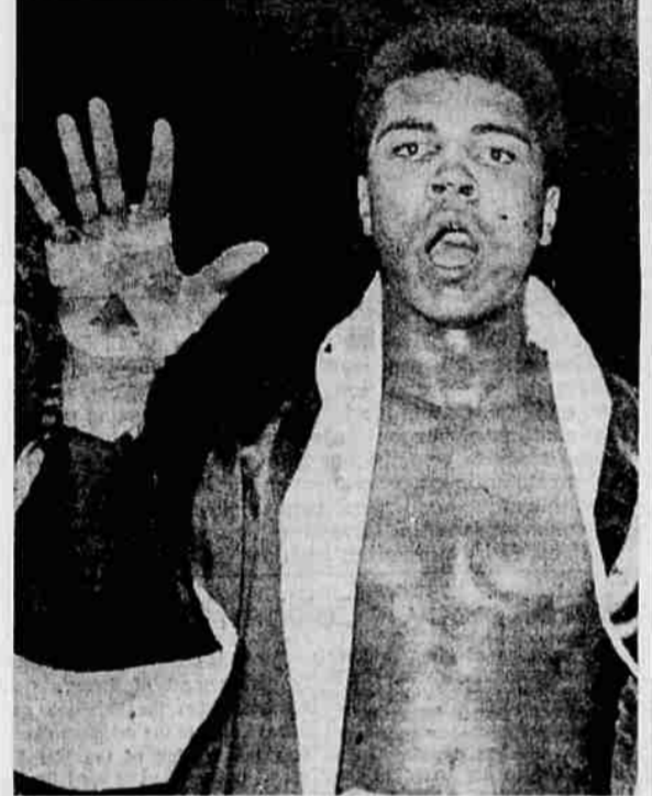
CASSIUS CLAY holds up five-count fingers to indicate that, true to his boast, he defeated British heavyweight champ Henry Cooper in five rounds Tuesday. The "Louisville Lip" won on a TKO when the referee stopped the fight in the fifth to save the profusely bleeding Briton.