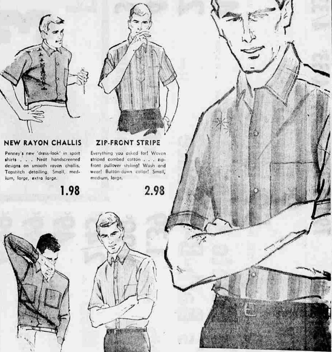
NEW RAYON CHALLIS Penney's new 'dress-look' in sport shirts... Neat handscreened designs on smooth rayon challis. Topstitch detailing. Small, medium, large, extra large. 1.98