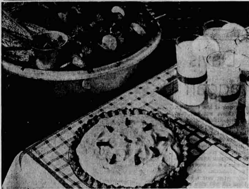
... backyard barbecue