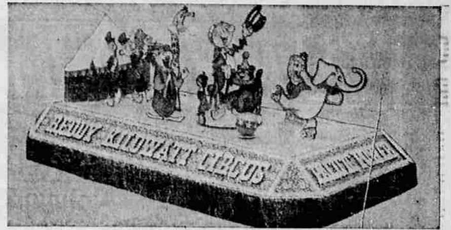
FIRST TO ANNOUNCE — Animated circus animals performing at the command of circus ringmaster "Reddy Kilowatt" is the theme for Pacific Power & Light Co.'s floor, the first entry officially announced for the Douglas County Rodeo parade in North Roseburg Saturday.

WASHINGTON (UPI) — U. S. military leaders have misgivings about President Kennedy's qualified new ban on testing nuclear weapons in the atmosphere. Some believe America should be developing a 100-megaton bomb such as the Russians claim to have. Armed forces chiefs were described today as believing national security requires continued testing of a variety of nuclear devices under present world conditions. A 100-megaton bomb, advocated by some military men, would have more political and psychological than purely military significance. America's present 25-megaton bombs are more than adequate militarily. But it is argued Amer-