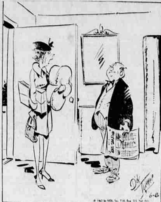
"Sure you're finding it harder and harder to make ends meet—especially your fingers and toes!"