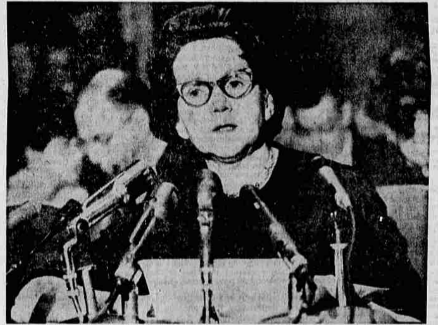
AUTHOR BIOLOGIST Rachel Carson is shown as she appeared before a Senate Government Operations sub-committee, studying pesticides. Miss Carson called for strict control of aerial pesticide spraying as a first step toward dealing with "contamination of the environment."