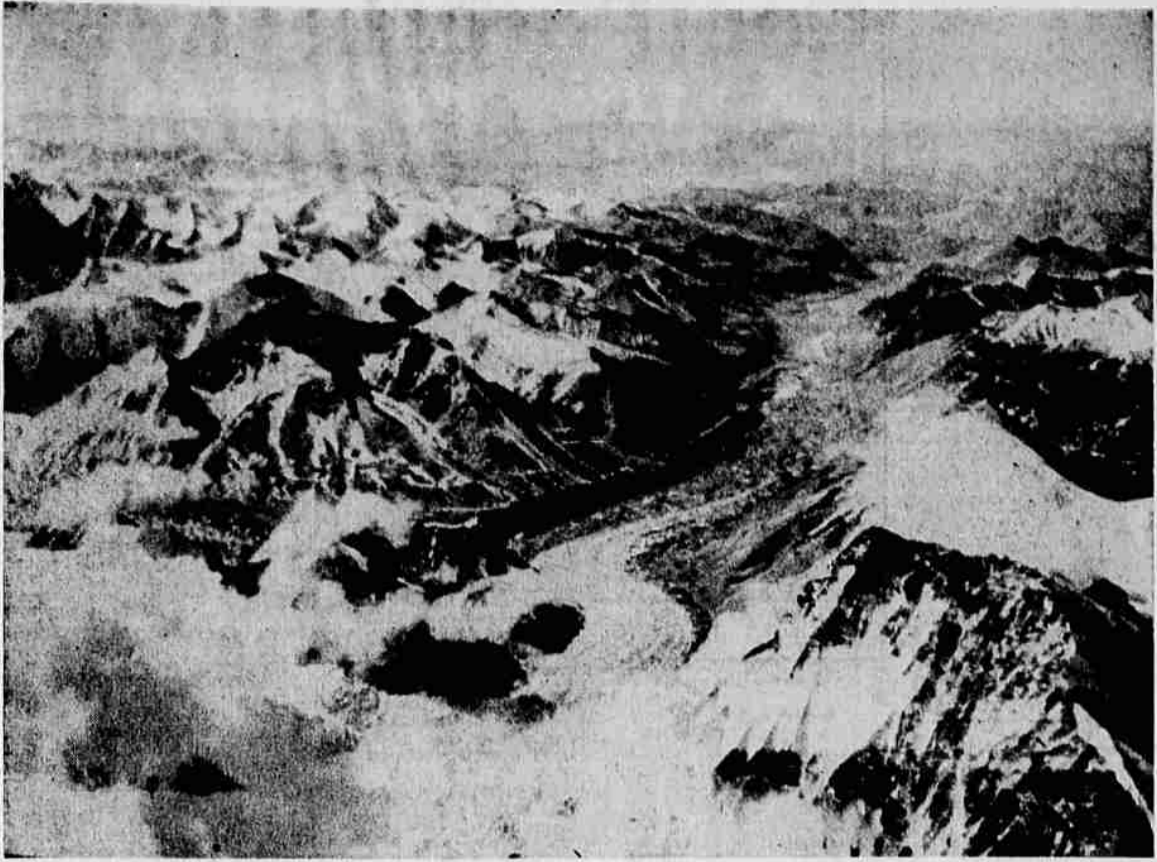
THIS VIEW OF FORBIDDEN TIBET was taken from 29,028-foot Mt. Everest, highest point on earth, by Barry C. Bishop, National Geographic Society staff member and a member of the Society's American Mt. Everest expedition. Bishop and his climbing partner, Luther G. Jerstad,

of Eugene, reached the summit May 22. Looking northwestward from Everest, the serpentine strip from the middle foreground to right background is the Rongbuk Glacier.