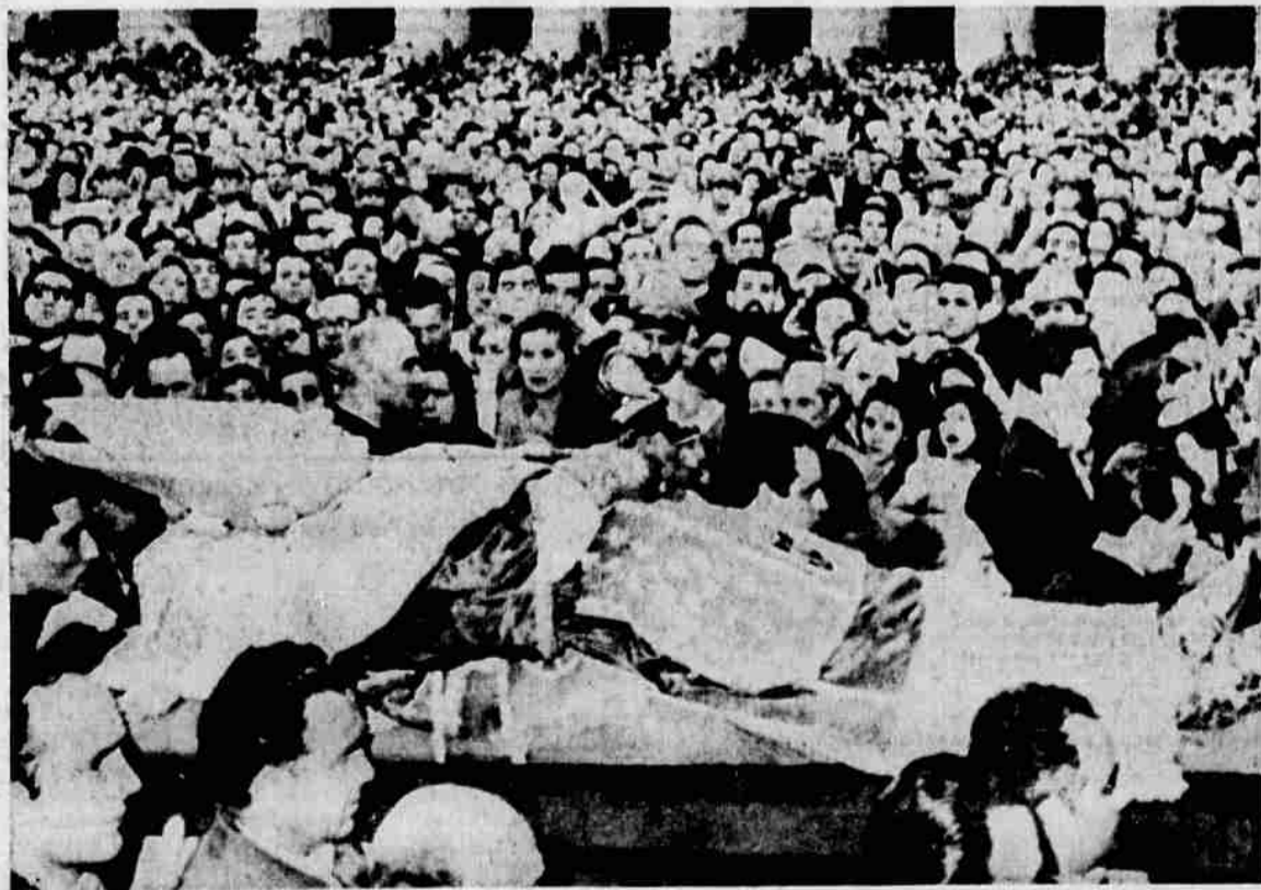
BODY OF POPE JOHN XXIII is carried in state through a crowd of thousands in St. Peter's Square Tuesday. The body was taken in procession from the Vatican to St.

Peter's Square, where it was to lie in state for the public to see.