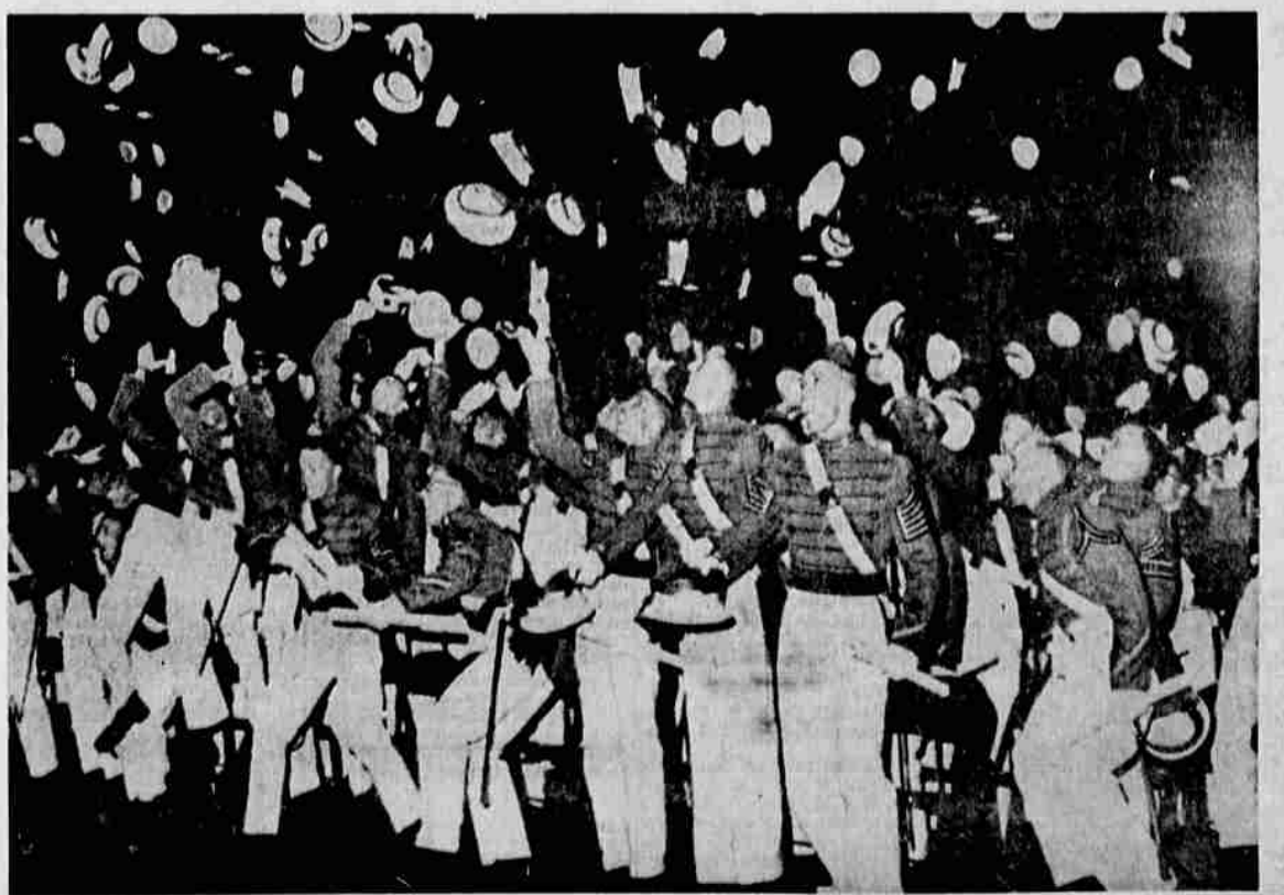
CADETS TOSS THEIR HATS in the air at the end of commencement exercises of the U.S. Military Academy at West Point. Graduation address was given by Maxwell D.

Peter's Square, where it was to lie in state for the public to see.