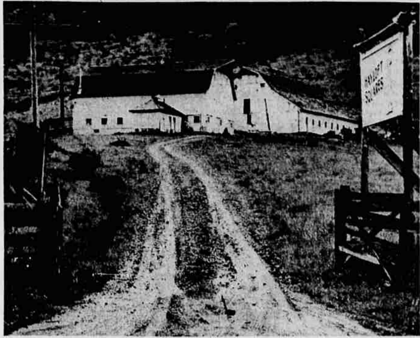
UMPQUA WEST THEATER is the name given the barn the Merely Players of Roseburg have taken as their new home. It is located about two miles west of Roseburg on the Melrose road. The group has completely remodeled the inside with a raised stage and the addition of regular theater seats.