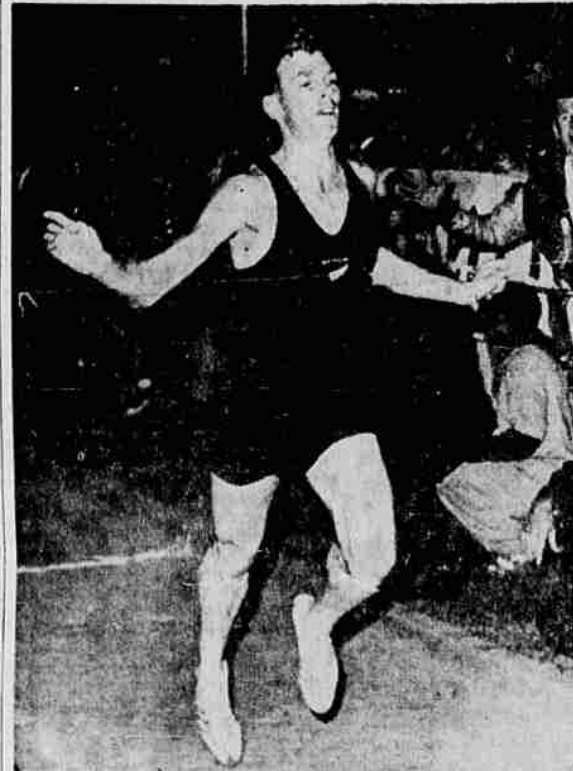
ALONE at the finish line is New Zealand's Peter Snell, holder of the world mile and 880 records. Snell outdistanced the field at Los Angeles in the 880 with a 1:48 clocking, but fell short of his own record of 1:45.1.

8 The News-Review, Roseburg, Ore. — Sat., June 1, 1963