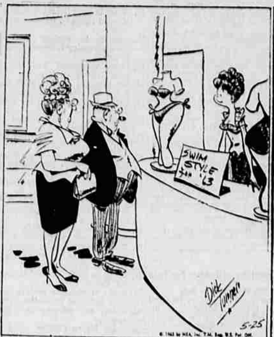
"I'll tell you why I need a new bathing suit! Because my old one has a hole in the knee!"