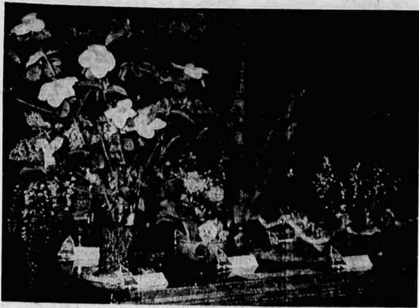
SPRING FLOWERS , such as the Dogwood, lilacs and lilies of the valley shown here were used for arrangements entered in the recent Spring Flower Show held in Glendale. The Glendale Garden Club was the sponsoring group. The show was held as a community attraction, primarily to give area residents a chance to show off their choicest blooms and skill in flower arranging. There was no judging and no prizes were given. Attendance was good, it was reported.