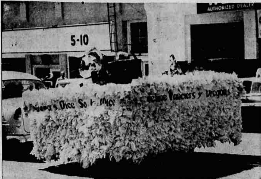
TOP PRIZE of $75 in the Myrtle Creek Fall Festival parade Saturday went to the Feline Fanatics Of Oregon in the non-commercial division. A camp fire group was second, and the Myrtle Creek Stockmen's float was third.