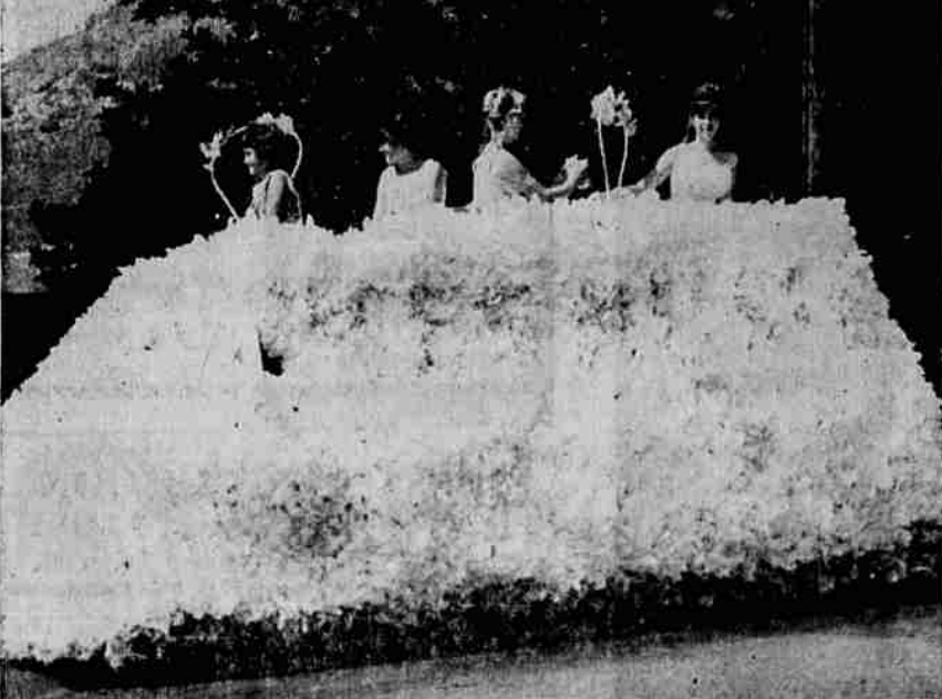
PAPER BLOSSOMS banking a bevy of Myrtle Creek beauties added up to a trophy for Rice's Music Store in the commercial division of the Myrtle Creek Fall Festival parade. Second and third places went to Dave's 76 station and Del's Building Supply. Trophies won revolve from year to year.