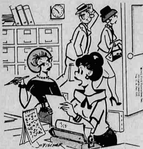
"The boss is so considerate of his wife. He takes her on dinner every night... to avoid eating her cooking."