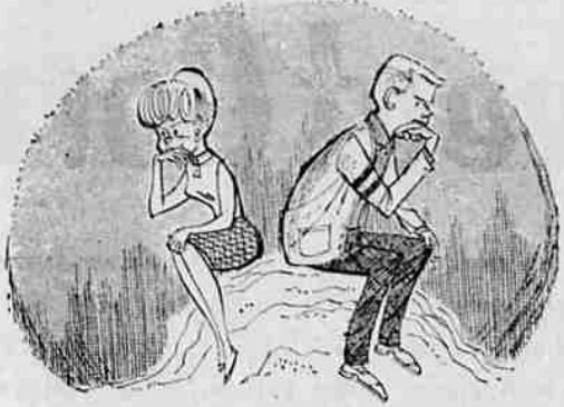
By and large, today's thinking teen-agers are conservative.

What are teen-agers really like? Are they materialistic, venturesome, dreamy-eyed, non-conforming, analytical?